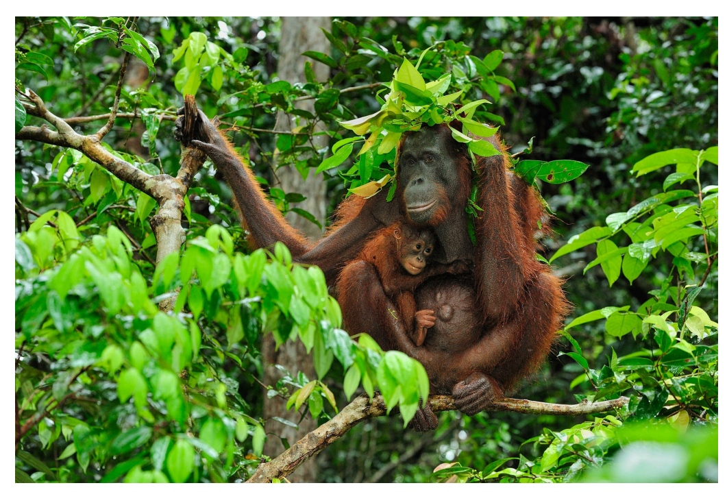
Mother Orangutan with Baby

Orangutans are smart. They use sticks to pry open fruits that are too prickly to touch.