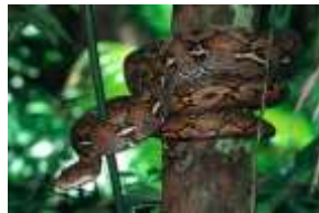
boa constrictor ____